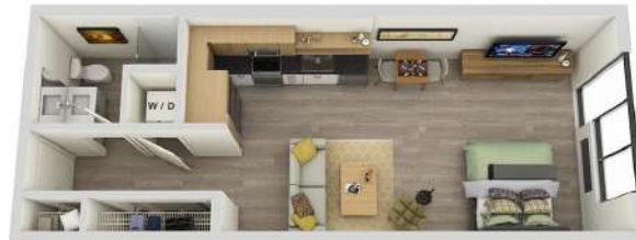
Floorplan S5 | 553 sq. ft.