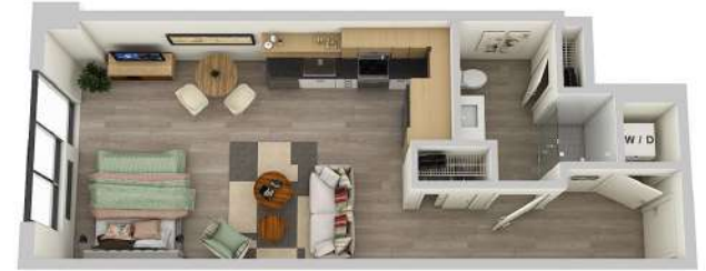
Floorplan S3 | 527 sq. ft.