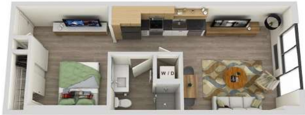
Floorplan S4 | 551 sq. ft.