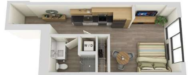
Floorplan S6 | 420 sq. ft.