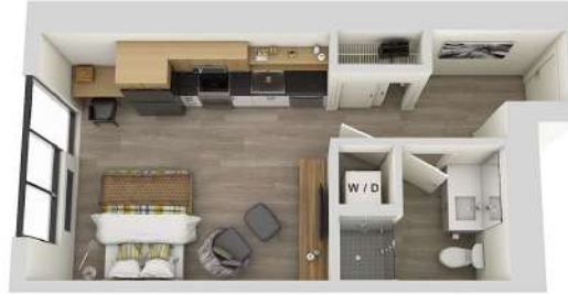
Floorplan S2 | 421 sq. ft.