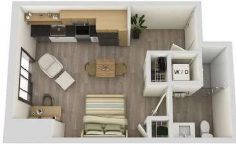
Floorplan S1 | 408 sq. ft.